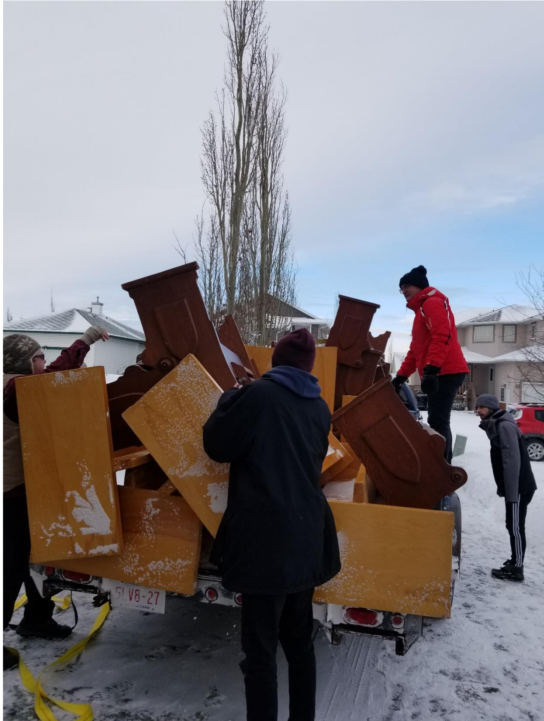
Moved the generously donated church pews out of storage.