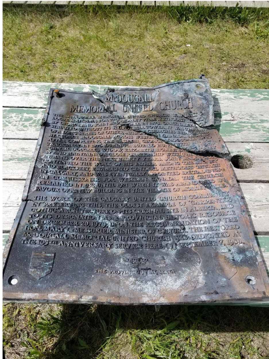
The McDougall Memorial United Church plaque found in the church.