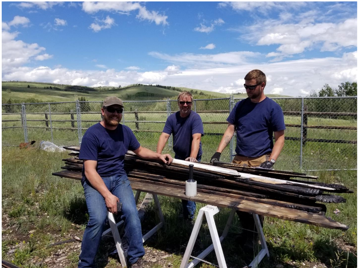
The crew is hard at work taking off the cladding.