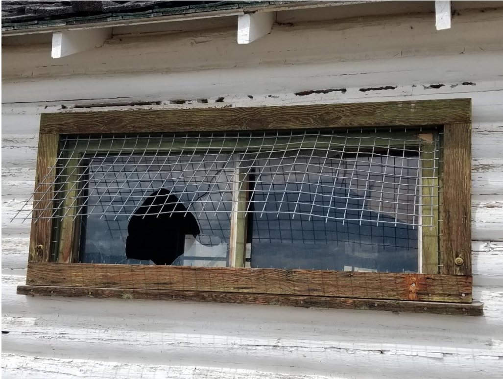
The window of the cabin that had a rock thrown through it