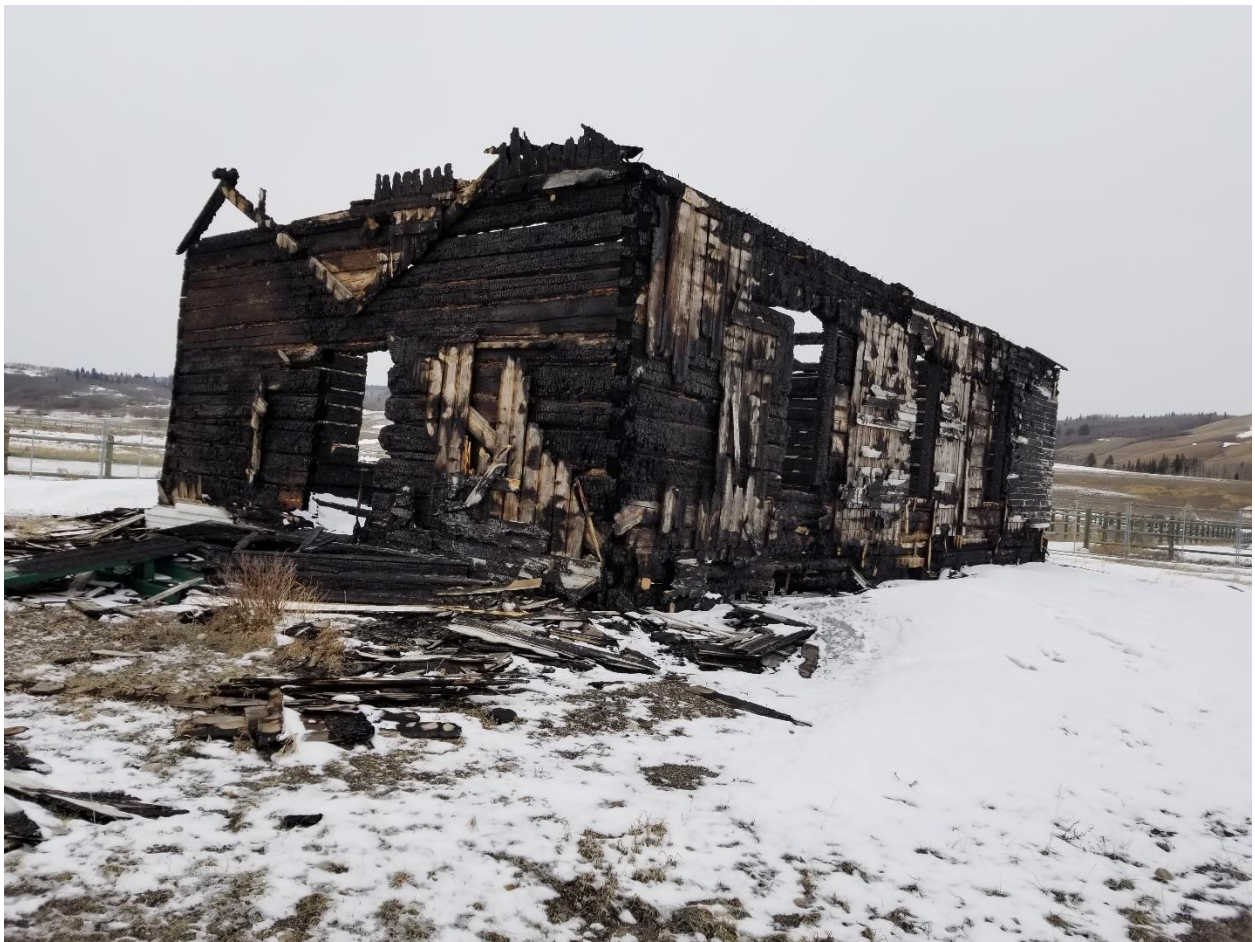
Photo of the McDougall Memorial United Church when the new board was voted in.