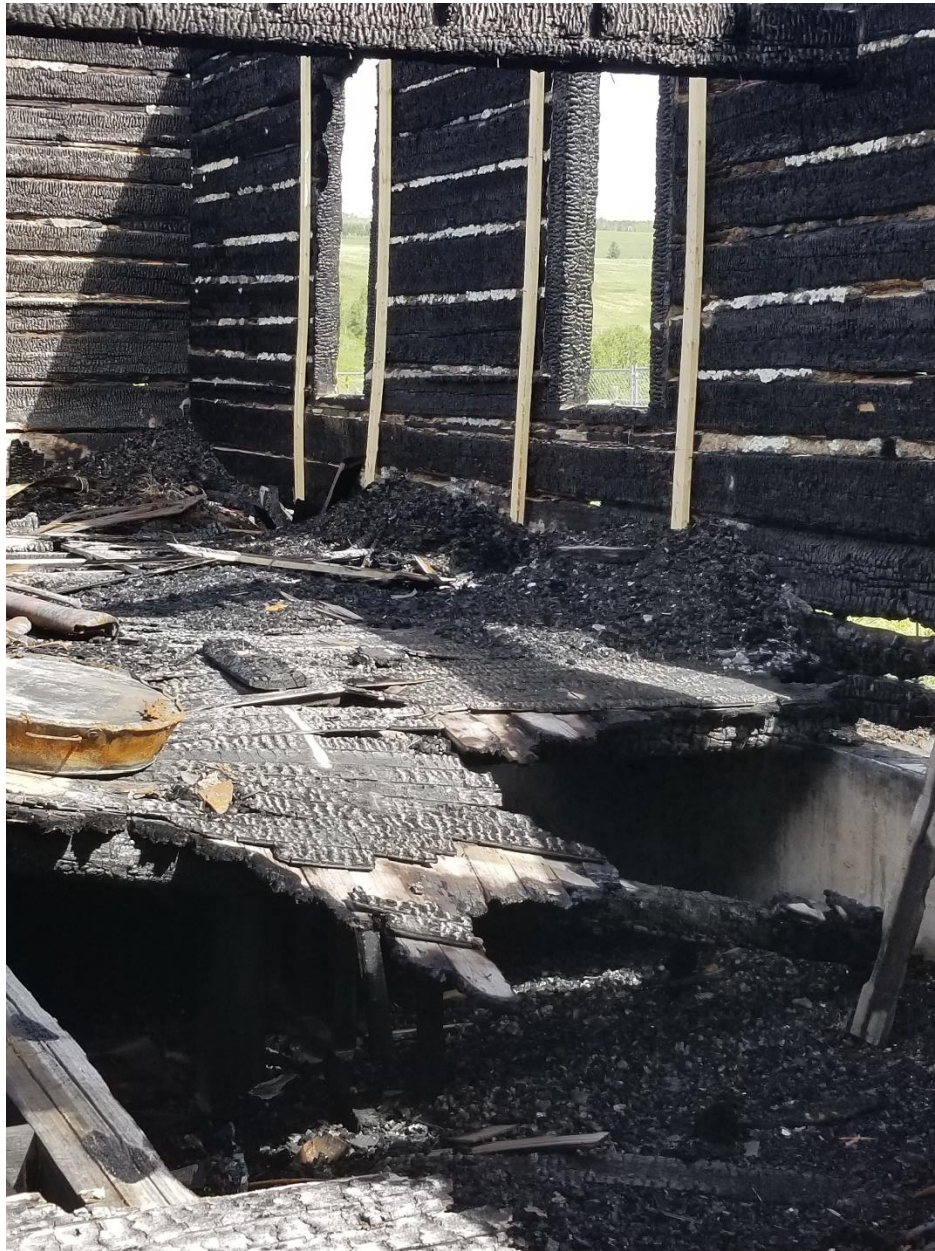
A photo of the inside of the church. You can see the ring from the bottom of the wood burning stove and the floor that caved in.