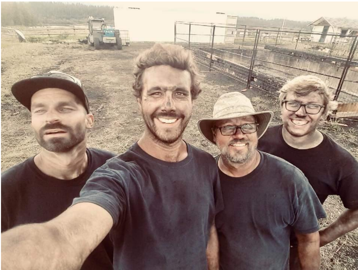
The crew get covered in charcoal many days that they worked on the church. Today they take a photo as the clean up is complete.