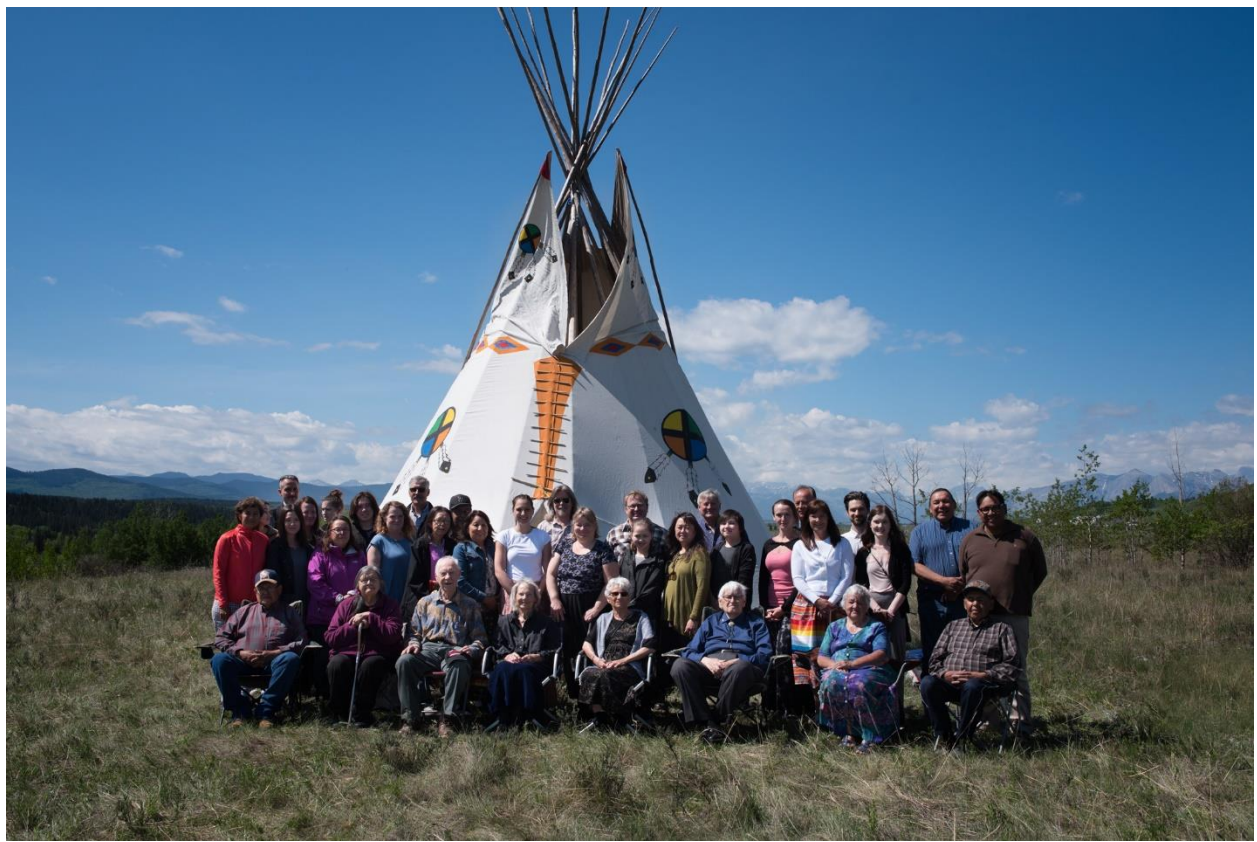
Photo of the members of the McDougall Stoney Mission Society at the historic Pipe Ceremony