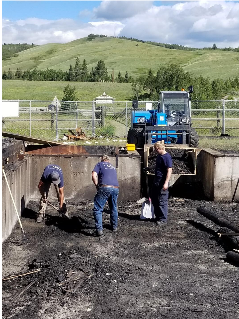
The dirty job of picking up all the charcoal.