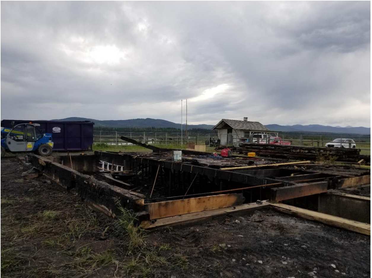
The church has all been taken down and now the floor and crawl space need to be cleaned up.